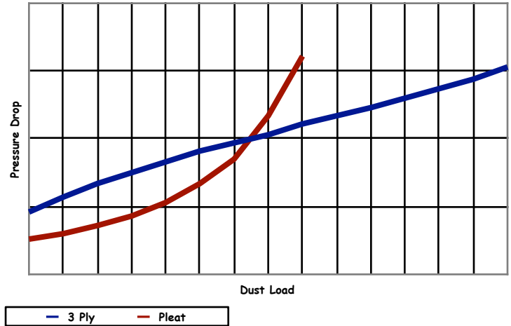
RESISTANCE vs. DUST LOADING

TRI-DEK ROLLUP filters also offer extended service life over pleated filters by 'managing' the dirt in a depth-loading media. The graph to the right shows the results from a laboratory test that confirm that TRI-DEK 15/40 will outlast a high capacity pleat - these results show a 75% longer life for TRI-DEK, that is nearly twice the service life. This translates into huge savings by reducing the number of filters you need to purchase, reduced shipping storage cost, reduced labor cost and reduced disposal cost just to name a few areas where savings will be generated.