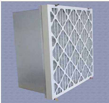
Tri-Met HPC holds a two-inch Tri-Pleat pleated filter to our Tri-Cell ASHRAE Box filter (above). Below is a close-up of the Tri-Met HPC attached to a box filter and holding a prefilter pleat.