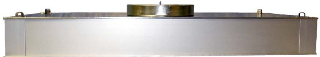
Profile view of the TRI-PURE™ Terminal Module

The TRI-PURE™ media pack is manufactured on a computer-controlled pleater for consistent and repeatable media packs.