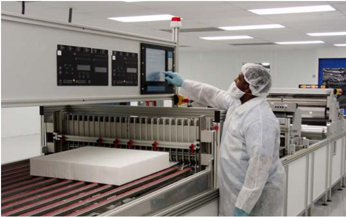
Tri-Dim's Cleanroom Production Area

Tri-Dim is proud of our quality-controlled TRI-PURE™ production facility that houses our state-of-the-art manufacturing equipment.