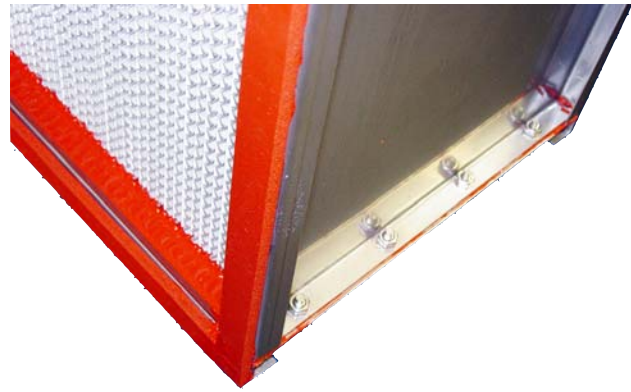
Close-up of TRI-PURE™ HEPA HT frame media pack and sealant

The TRI-PURE™ HEPA HT and HEPAMAX™ HT filters utilize a high temperature silicone sealant. This silicone compound sealant is rated up to 500°F (260°C) of continual service.