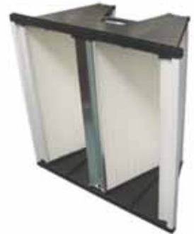
Predator II V-Cell Filters