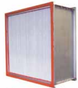
Tri-Pure™ HT HEPA Filters