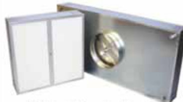
Tri-Pure™ Terminal Modules