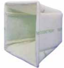
Tri-Cube™ Cube Filters