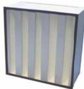
Tri-Pure™ 2000 HEPA Filters