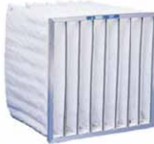
Syn-Pac™ Bag Filters