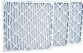
Tri-Pleat™ Pleated Filters

Tri-Dim's Environmental Series offers innovative solutions to today's demanding Sustainability Initiatives. Tri-Dek E Panels offer many "Sustainability" features such as no metal construction, recycled content and LEED Credits.