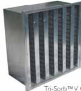
Tri-Sorb™ V Carbon