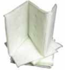
Tri-Dek® Panel & Link Filters