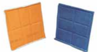
Tri-Dek® E Panels