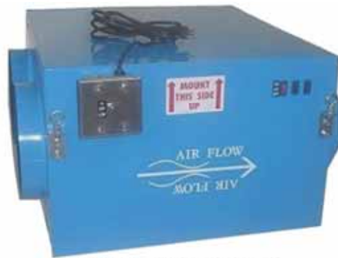
LP-1000 Low Profile Air Cleaner