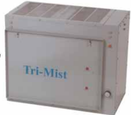
Tri-Mist 500 Mist Elimination System